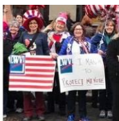
"FAILURE IS IMPOSSIBLE"